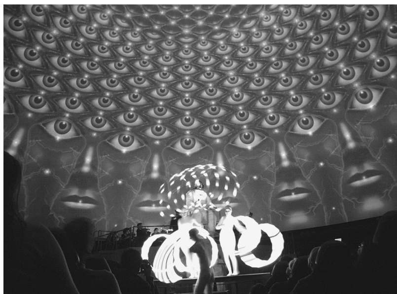
Gotham Chamber Opera, 2010 production of Il Mondo Della Luna at the Hayden Planetarium.