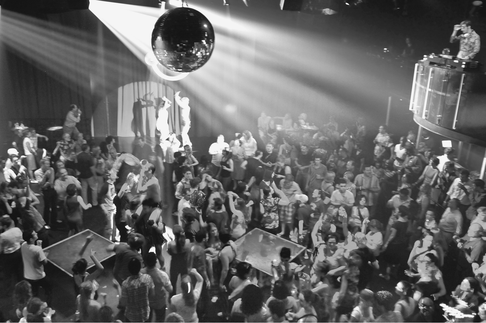
American Repertory Theatre, 2011 production of The Donkey Show at the Oberon.

the term “sovereignty” to characterize the authority that audiences want over their arts experiences (2008, p. 6). Of course, many people profoundly enjoy sitting quietly and taking in a live performance, or viewing art that is not interactive at all, without feeling under-engaged or disempowered.