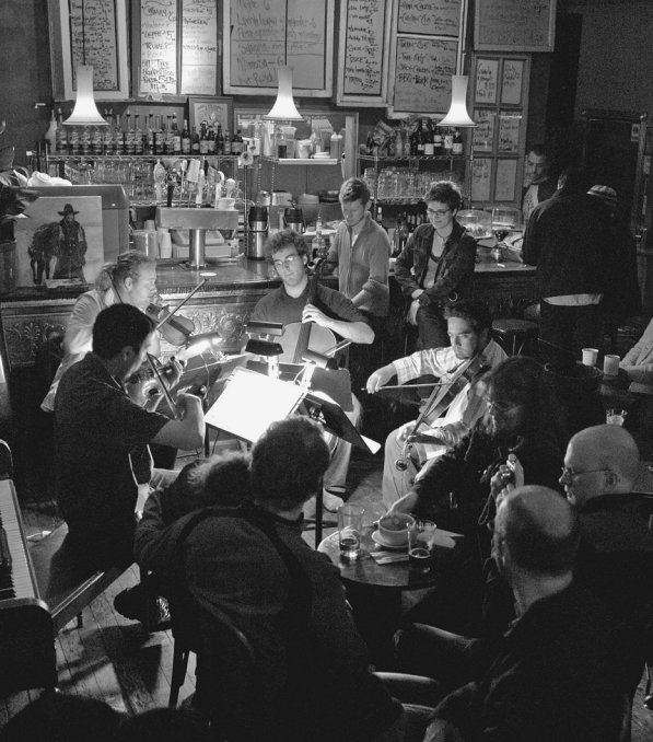
A Classical Revolution concert at the Revolution Café in San Francisco

relationship and encourages its audiences “to activate their senses and become participants in the world of the play”. 15 Similarly, the Da Camera Society in Los Angeles has built a distinct identity by carefully matching chamber music artists with historic sites, including architecturally significant homes, ornate ballrooms, cathedrals, and even the RMS Queen Mary . 16